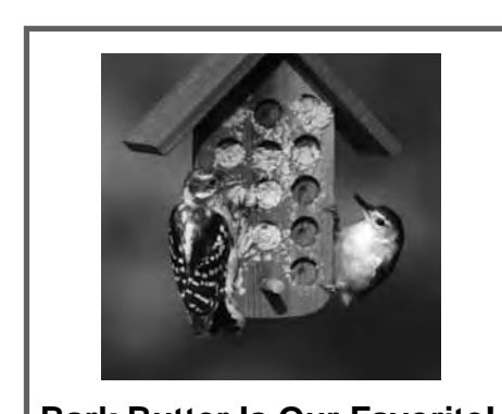
Bark Butter Is Our Favorite!