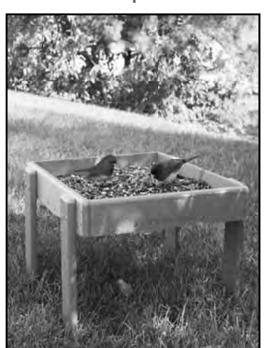
EcoTough Ground Tray with WBU Deluxe Blend