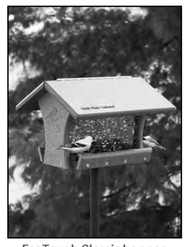
EcoTough Classic hopper feeder with WBU Deluxe Blend

Birds tend to choose feeders that are at the same height where they would find food in the wild. Imitating these natural feeding levels will help you attract the most birds to your backyard.