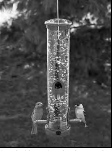
with WBU Supreme Blend